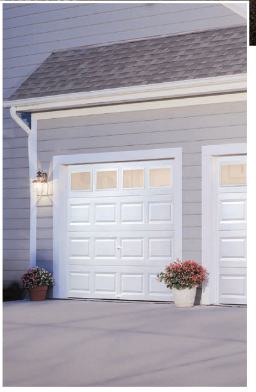
Model T42S, Short Traditional Panel with Plain Short Windows